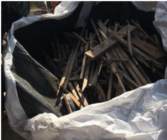
Figure 3. Wooden slats removed from an historical bole house in Visby (the same property as in Fig. 2).