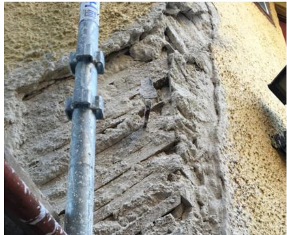
Figure 1. Exposed plaster embedded in wooden slats on a house in Visby. A lime-cement render had been applied in an earlier renovation (yellow render).

Nowadays building owners often remove the lime plaster and wooden slats on the outside, and replace them with a more modern insulation material such as mineral wool, wood-fibre or polystyrene to improve energy efficiency of the building (Figures 2-4). Then a new cement render or lime-cement render is applied. By using a (lime-)cement render instead of a traditional lime render the historical character of the building is lost, and in combination with the mineral wool or polystyrene insulation its hygrothermal properties are deteriorated.