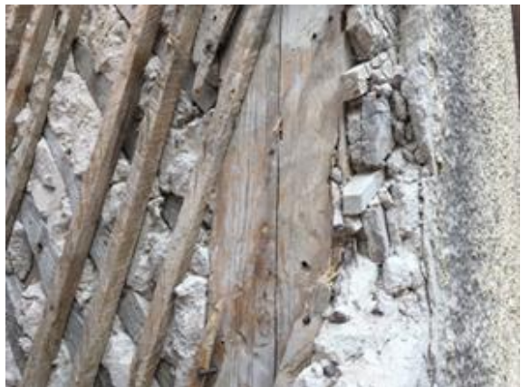
Figure 2. Exposed lime plaster embedded in diagonal wooden slats on another property in Visby. Here the lime and wooden slats were removed in order to apply mineral wool insulation with the goal to improve energy efficiency.

The town center in Visby is protected by heritage laws. There is a municipal zoning plan with a building order stating rules for the preservation of the historic town center. A general rule is to remove as little as possible and preserve the existing traditional constructions. Lime-hemp will be studied as a means to preserving the whole wall construction and also to improve its thermal properties; in order to attach lime-hemp it is advantageous to keep the existing construction with wooden slats or pegs. The more we manage to preserve of the traditional construction the less cultural values will be lost when renovating these buildings.