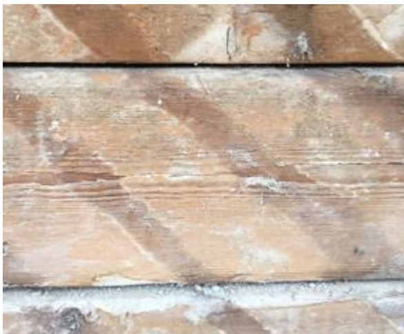
Figure 4. Exposed timber of an historical bole house in Visby (the same property as in Fig. 2 and 3) after the wooden slats and lime plaster had been removed.