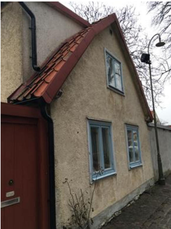
Figure 8. Historical timber building in Visby. The façade will be renovated using lime-hemp in 2017.

In the two rooms behind the two wall sections temperature is kept at constant room temperature, and energy use is monitored continuously, resulting in a value for energy performance (in kWh/m 2 ·year).