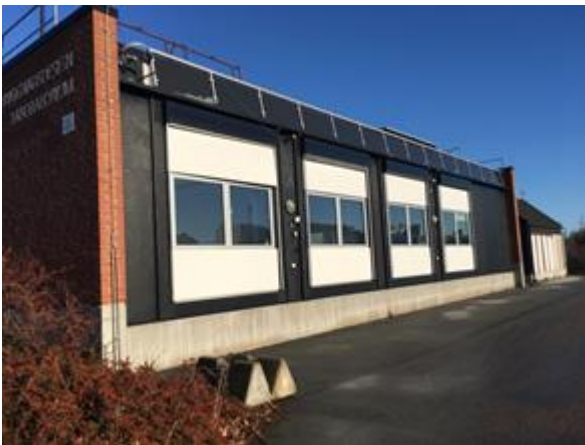
Figure 7. Two façade sections will be replaced with "historical" timber façades.