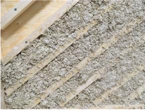
Figure 6. Testing workability of lime-hemp in between wooden slats in the lab.